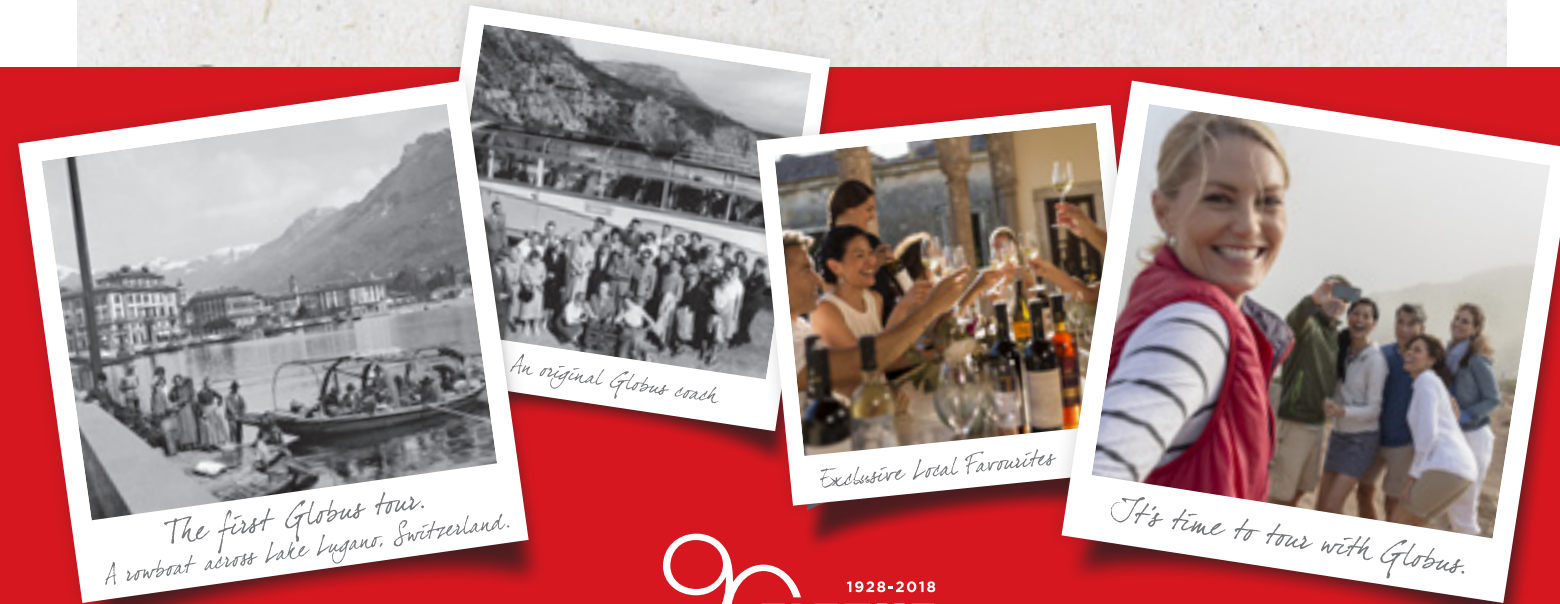
The first Globus tour. A rowboat across Lake Lugano, Switzerland.

1918 From humble beginnings... 2018 ...to travel innovators