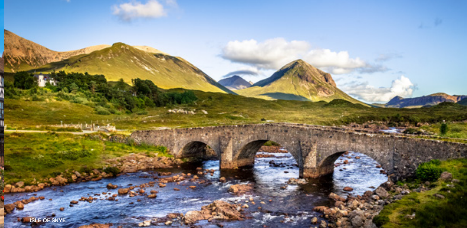
ISLE OF SKYE