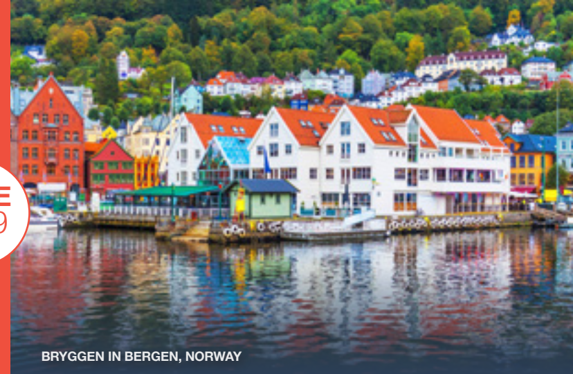
BRYGGEN IN BERGEN, NORWAY