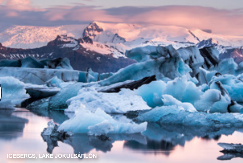
ICEBERGS, LAKE JÖKULSÁRLÓN