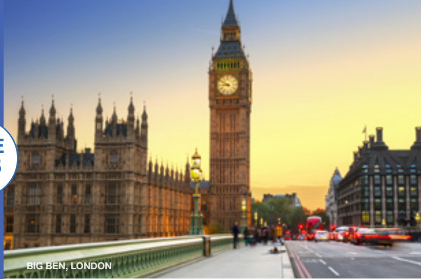
BIG BEN, LONDON