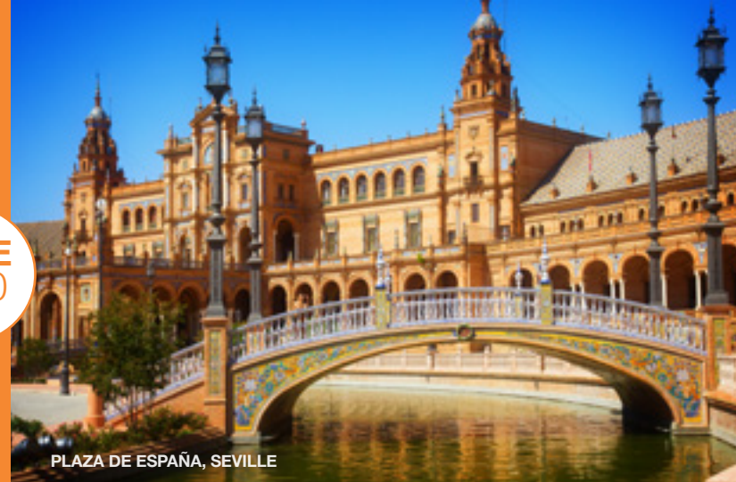
PLAZA DE ESPAÑA, SEVILLE