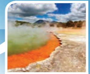
Thermal Explorer Highway