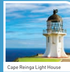
Cape Reinga Light House

The mystical land of white clouds is a sanctuary for nature lovers as well as a haven for the adrenalin-junkie. The two islands showcase unique personality in incredible scenery, climate, food and culture. New Zealand's subtle charm is a treasure trove for holiday makers. Hire a car or a motorhome to see more of this gorgeous country.