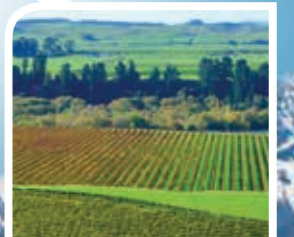
The Classic Wine Trail