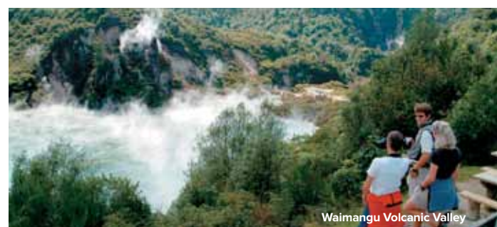
Waimangu Volcanic Valley