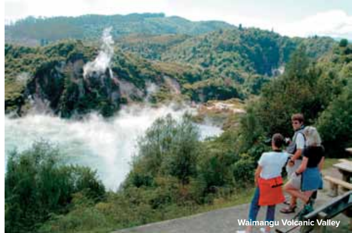
Waimangu Volcanic Valley