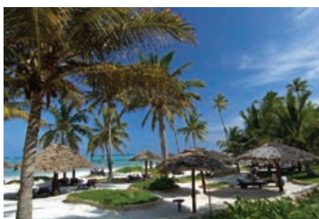
BREEZES BEACH CLUB & SPA

INCLUDED: Breakfast, lunch, dinner, local drinks and return airport transfers.