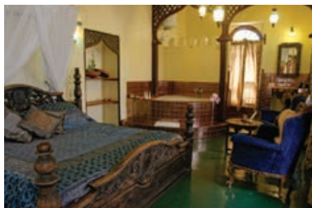
ZANZIBAR PALACE HOTEL