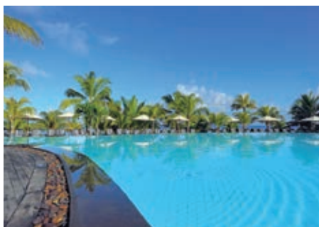
VICTORIA RESORT & SPA

INCLUDED: Breakfast, dinner and return airport transfers.