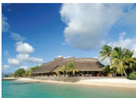
PARADIS GOLF RESORT & SPA

INCLUDED: Breakfast, dinner and return airport transfers.