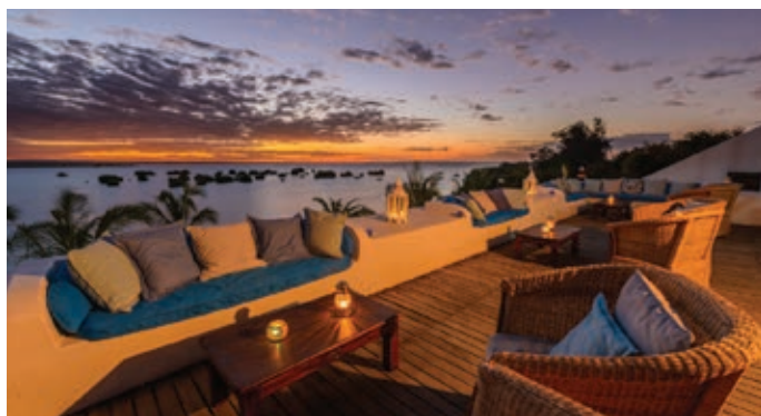
IBO ISLAND LODGE

The white beaches and protected coral reefs of the relatively unknown Quirimbas Archipelago, off the coast of northern Mozambique, are still very untouched, but rapidly becoming the 'hottest' new destination. With history and ancient culture, combined with crystal clear azure waters, abundance of marine life – a diving, deep sea fishing and snorkelling paradise – and boutique accommodation, it makes this region a very special place. Inhambane, a photographer's dream with its old architecture, fascinating mix of African, old-world Portuguese and Muslim cultures and colourful markets, is located in southern Mozambique, and one of the oldest settlements. Together with deserted beaches, clear tropical water and palm trees, you will find a wonderful holiday destination.