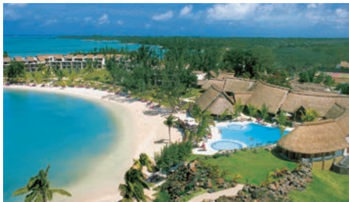
LUX* GRAND GAUBE