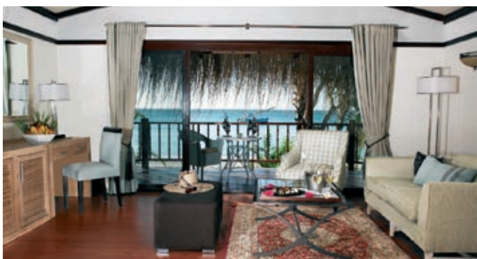
ANANTARA BAZARUTO ISLAND RESORT & SPA

INCLUDED: All meals, tea/coffee, non-motorised activities, guided historical tour and daily boat transfer to beach and return light aircraft flights from Pemba.