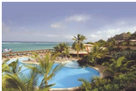
LEOPARD BEACH RESORT & SPA