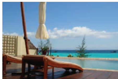
THE Z HOTEL

INCLUDED: Breakfast and return airport transfers.