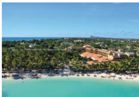
MAURICIA RESORT & SPA