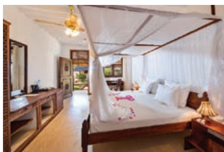
DIAMONDS MAPENZI BEACH

INCLUDED: Breakfast and return airport transfers.