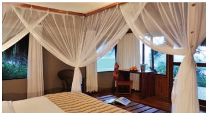
MACHANGULO BEACH LODGE

NOTE: Daily departures based on a minimum of 2 passengers. Solo traveller price on request. Seasonal supplements and luggage restrictions apply. Stay, Pay deals and Honeymoon Specials available (conditions apply). Contact us for further details.