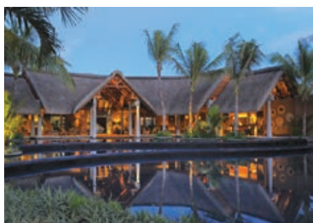
TROU AUX BICHES GOLF RESORT & SPA

INCLUDED: All inclusive package and return airport transfers.