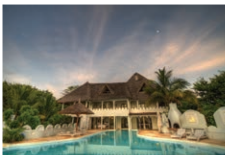
MSAMBWENI BEACH HOUSE

INCLUDED: Breakfast, lunch, dinner, local drinks and return airport transfers.