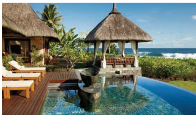
SHANTI MAURICE A NIRA RESORT

NOTE: Daily departures based on a minimum of 2 passengers. Solo traveller price on request. Seasonal supplements apply. Surcharge applies for Shanti Maurice if booking within 45 days of departure. Long Stay deals and Honeymoon Specials available (conditions apply). Contact us for further details.