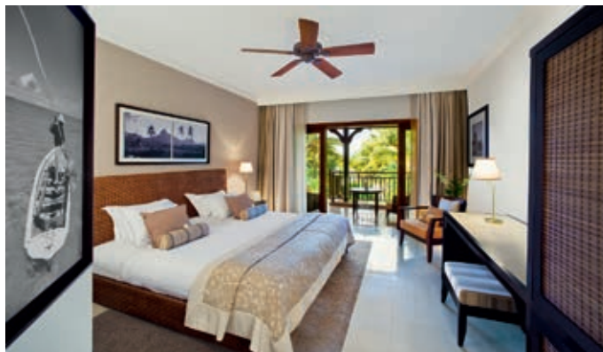
LUX* LE MORNE

INCLUDED: Breakfast, dinner and return airport transfers.