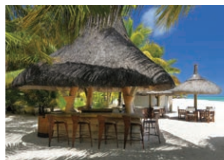
DINAROBIN GOLF RESORT & SPA

INCLUDED: Breakfast, dinner and return airport transfers.