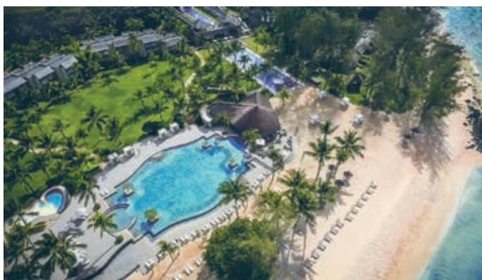
OUTRIGGER MAURITIUS BEACH RESORT

INCLUDED: Breakfast, dinner and return airport transfers.