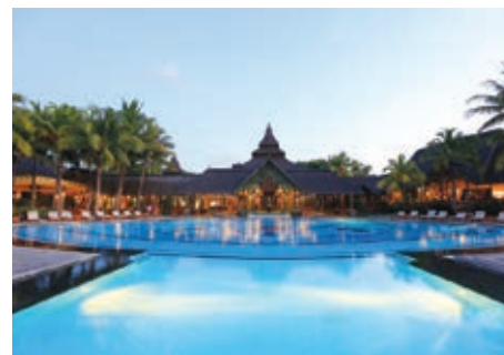
SHANDRANI RESORT & SPA

INCLUDED: Breakfast, dinner and return airport transfers.