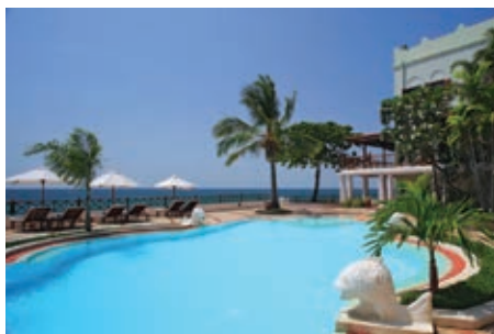
ZANZIBAR SERENA INN

INCLUDED: Breakfast and return airport transfers.