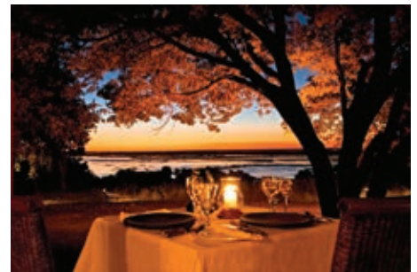
SANCTUARY CHOBE CHILWERO

INCLUDED: Meals, local drinks, laundry, safari activities and road transfers from Kasane.