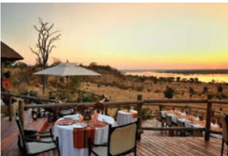
NGOMA SAFARI LODGE

INCLUDED: Meals, local drinks, laundry, safari activities, Park fees and road transfers from Kasane.