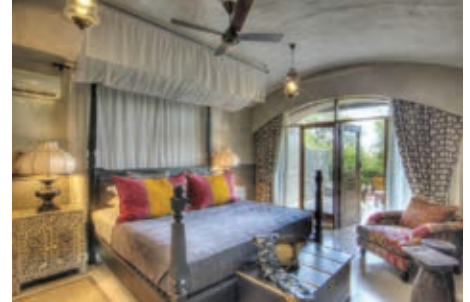
CHOBE GAME LODGE

INCLUDED: Meals, local drinks, laundry, safari activities, Park fees and road transfers from Kasane.