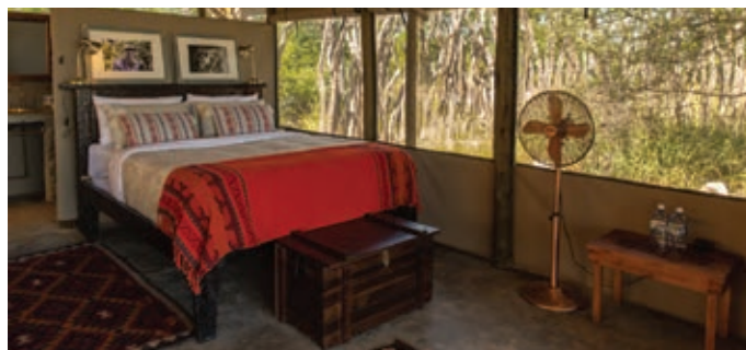
MENO A KWENA TENTED CAMP

INCLUDED: All meals, local drinks, laundry, game activities and return light aircraft transfers from Maun.