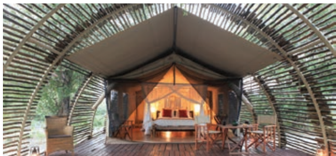
HAINA KALAHARI LODGE

In contrast to the lush waterways of the Okavango Delta and the ever-flowing Chobe River, the Central Kalahari Game Reserve and Makgadikgadi Pans National Park offer a completely unique experience. Whether exploring Deception Valley or walking with bushmen in the Central Kalahari or visiting Chapman's Baobab, quad biking or interacting with habituated meerkats in the Makgadikgadi, this dramatic region of Botswana is the perfect complement to Botswana's water wonderland.