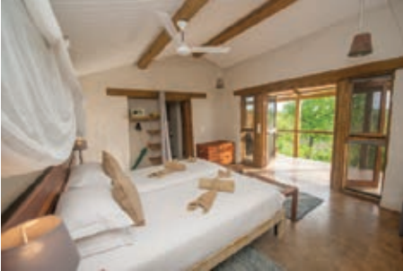
CHOBE ELEPHANT CAMP