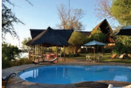
MUCHENJE SAFARI LODGE

INCLUDED: Meals, local drinks on activities, laundry, safari activities, Park fees and road transfers from Kasane.